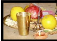
Yoga Purnima, Rikhiapeeth