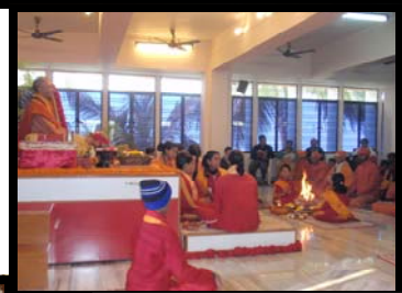
Satsang Week, Munger